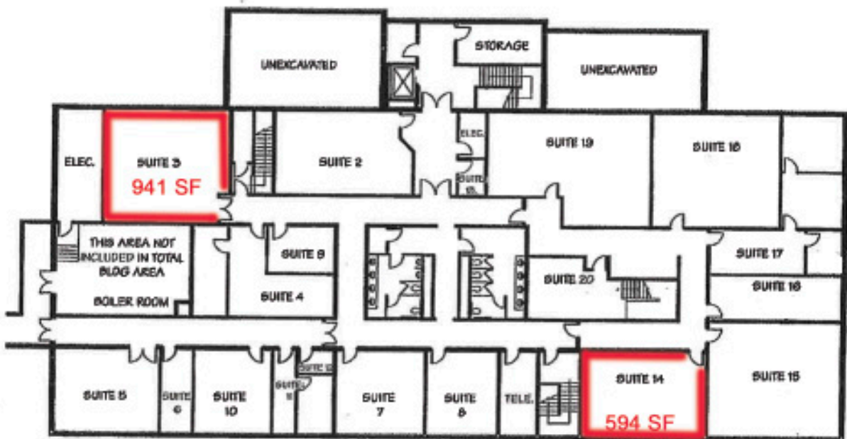
Diagram of Demised Premises