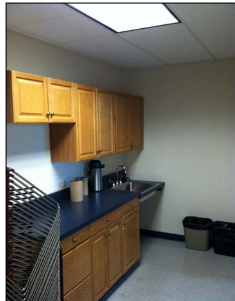
PANTRY OFF CONFERENCE ROOM